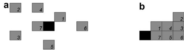
Fig. 1 – A fragmented (a); and an aggregated/connected (b) hypothetical configuration of a reserve system, each consisting of one mandatory site (dark square) and 7 other sites numbered 1–7 (gray squares). Both present the same value under the objective function (4).

To guarantee that the solutions include all the mandatory sites the equations