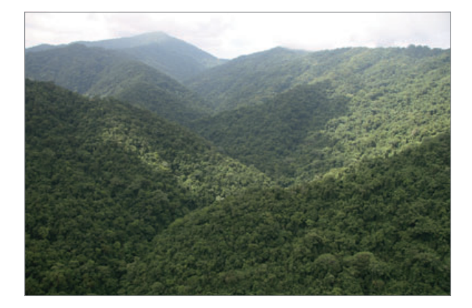
Figure 3. Hill forest habitat in Bauro Highlands that needs protecting, Makira island, Melanesia, December 2006.

natural perturbation caused by landslips on the steep slopes. In line with the general tendency in Melanesia (Mayr & Diamond, 2001), our observations confirm that the highland is home to most of the narrowly endemic species (Table 2). This environment may come close to being described as a climax community of co-adapted plants and animals.