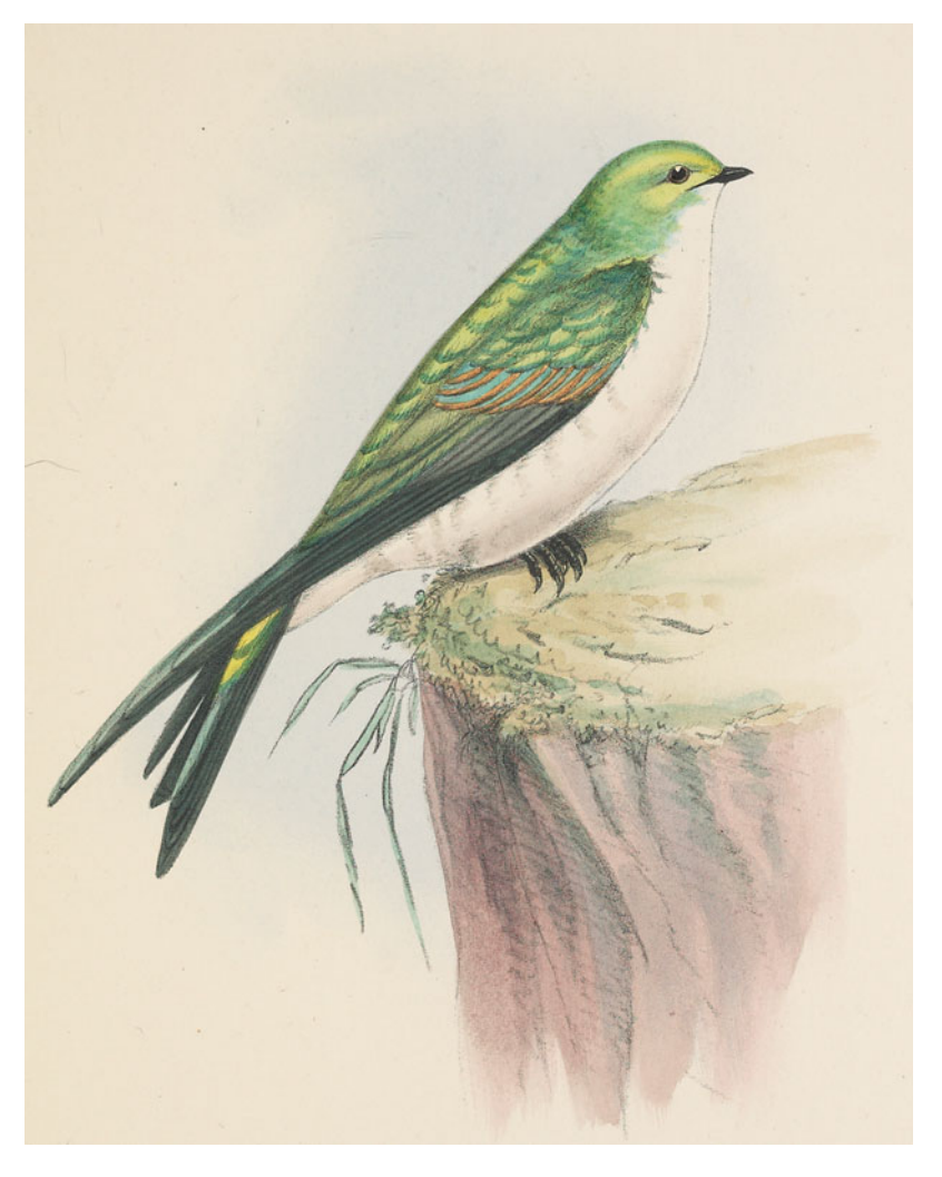
Figure 1. Lithograph of Golden Swallow from Plate 12 of Illustrations of the Birds of Jamaica (Gosse 1849).

road safety, cultural sensitivity, good sight lines, and distance from other census sites (minimum distance > 0.7 km). Census sites were located along paved roads, unimproved roads accessible with four-wheel drive vehicles, and along foot trails. Surveyed habitat included wet limestone forest, dry limestone forest, lower montane rain forest, mangrove forest, residential gardens and orchards, shaded coffee plantations, pasturelands with scattered old growth trees, church yards, ruinate woodland, and patchworks of secondary woodland, sugar cane, banana and coconut plantations, bamboo, agricultural scrub, and pasture. No censuses were conducted in plantation monocultures of sugarcane or in arid scrub lacking trees of sufficient stature ( \geq 10 m in height) along the southern coast. Ad hoc searches were conducted during several thousand kilometres of driving between census sites and on long distance trips though habitat that was outwardly unsuitable for swallows on the southern coastal plain.