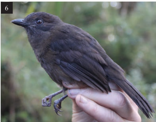
Figure 1. Immature Long-billed Cuckoo Chrysococcyx megarhynchus , Mt. Wilhelm, Papua New Guinea, 20 October 2015 (P. Z. Marki)