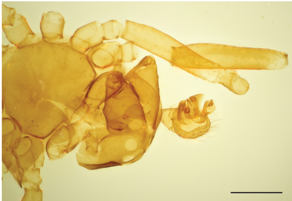
FIGURE 2. Holotype of Alaxchelicerca ordinaria Butler, 1932. Male habitus, ventral view (mounted on slide). Scale bar: 1 mm.