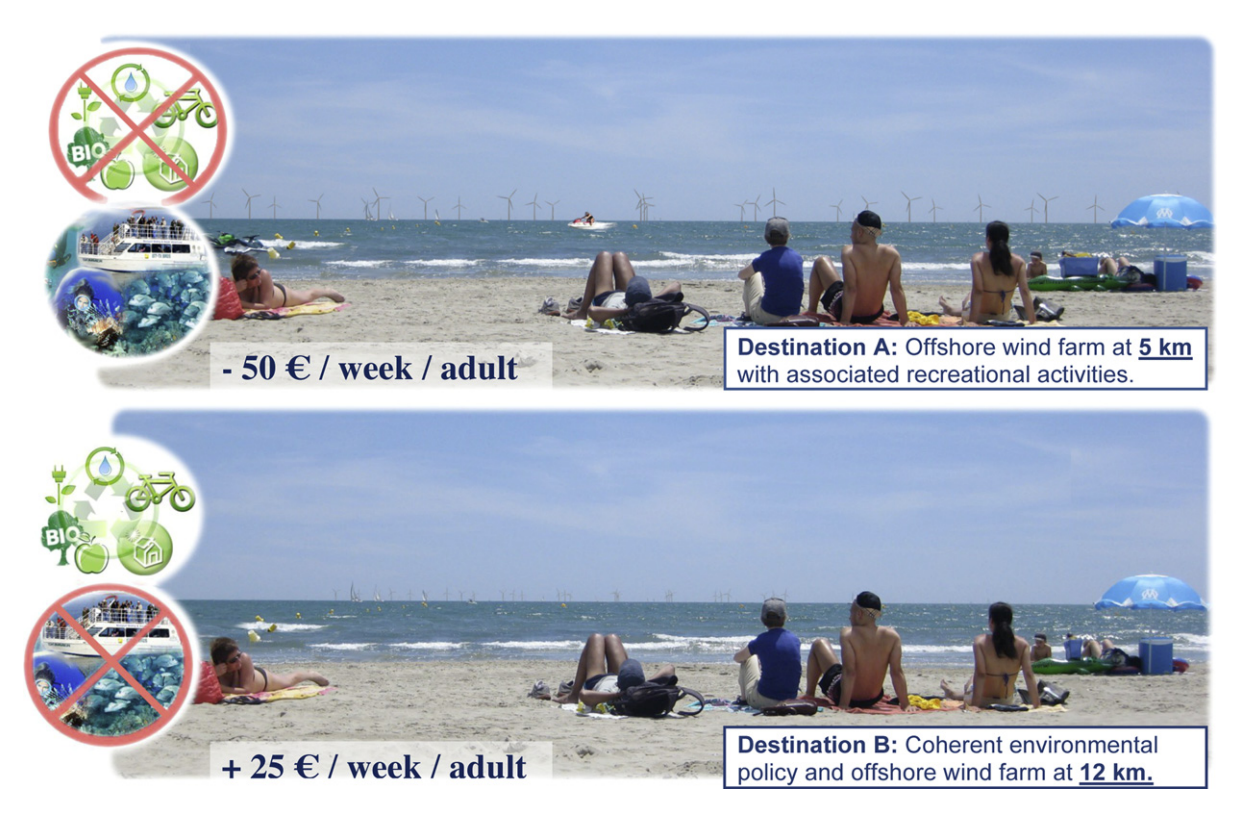
Fig. 2. An example of a choice set.

between wind farms and the coherent environmental policy. The resulting MNL d-error was 0.1085. Fig. 2